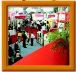
PlastIndia – India Feb., 2009

Bry-Air and DRI were present at almost all HVAC&R shows all over the world.