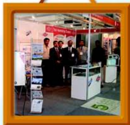
Big 5 – Dubai Nov., 2009