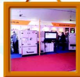
IPC – India Dec., 2009