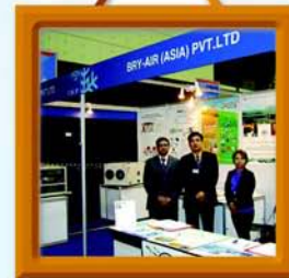
RHVAC – Bangkok Oct., 2009