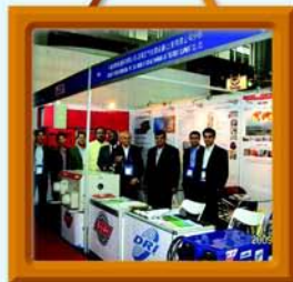
China Refrigeration — China April, 2009