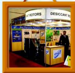
Febrava – Brazil Sept., 2009