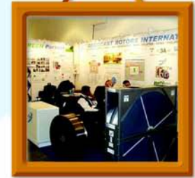
ISH – Germany March, 2009